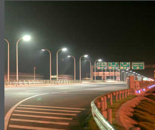
Pathfinder / 100 Watt LED Street Light